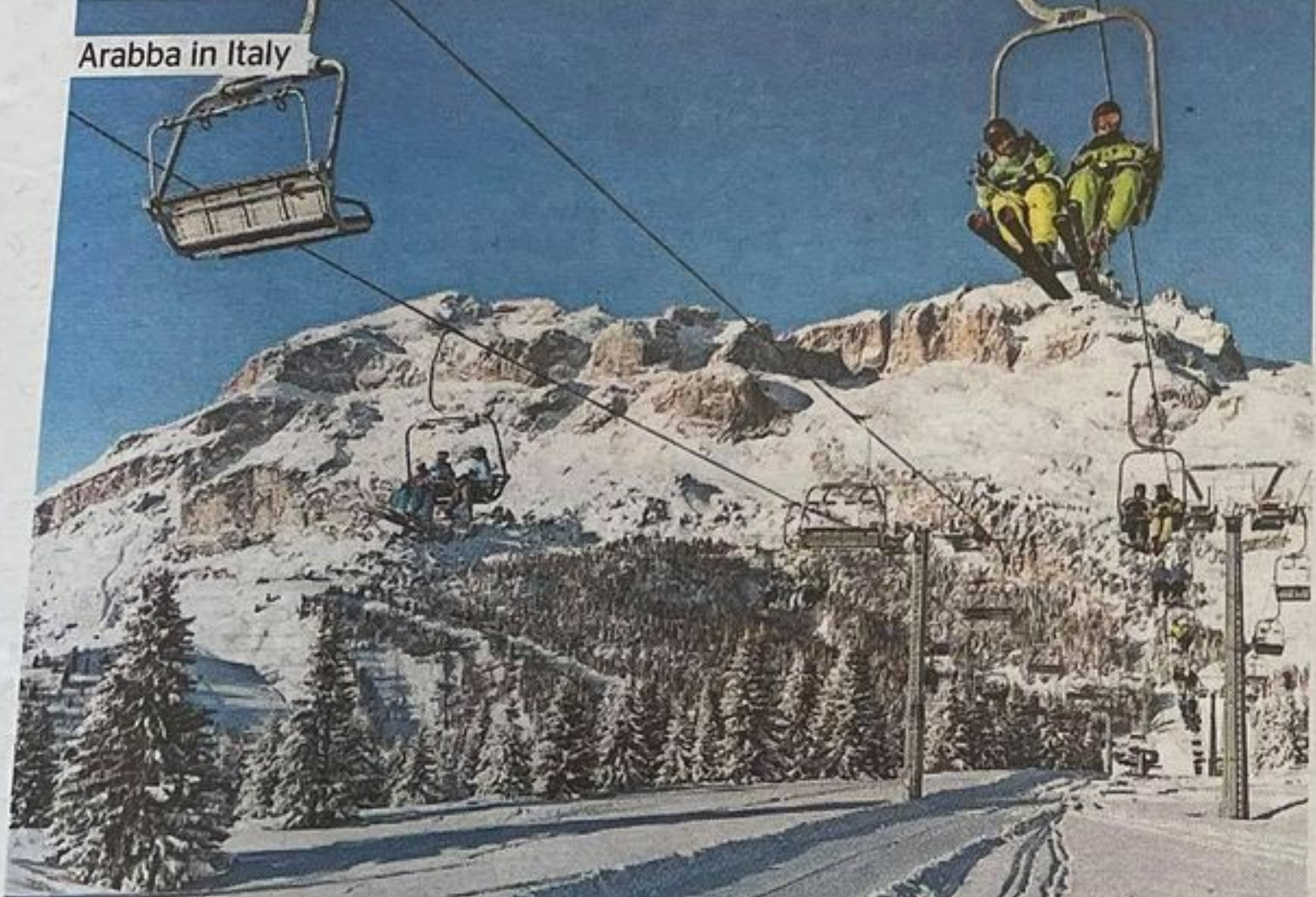
Arabba in Italy

Hotel Evaldo in Arabba is standing by. On the doorstep, a church and a huddle of houses, between two soaring Dolomite massifs. Beyond the giant spaghettini hoop of intermediate skiing the Sella Ronda. Less confident skiers will love exploring Alta Badia's gentle slopes, while speed freaks will bomb down Arabba's own pistes. Back at your family-run hotel, each day ends in its charming, wood-paneled dining rooms.