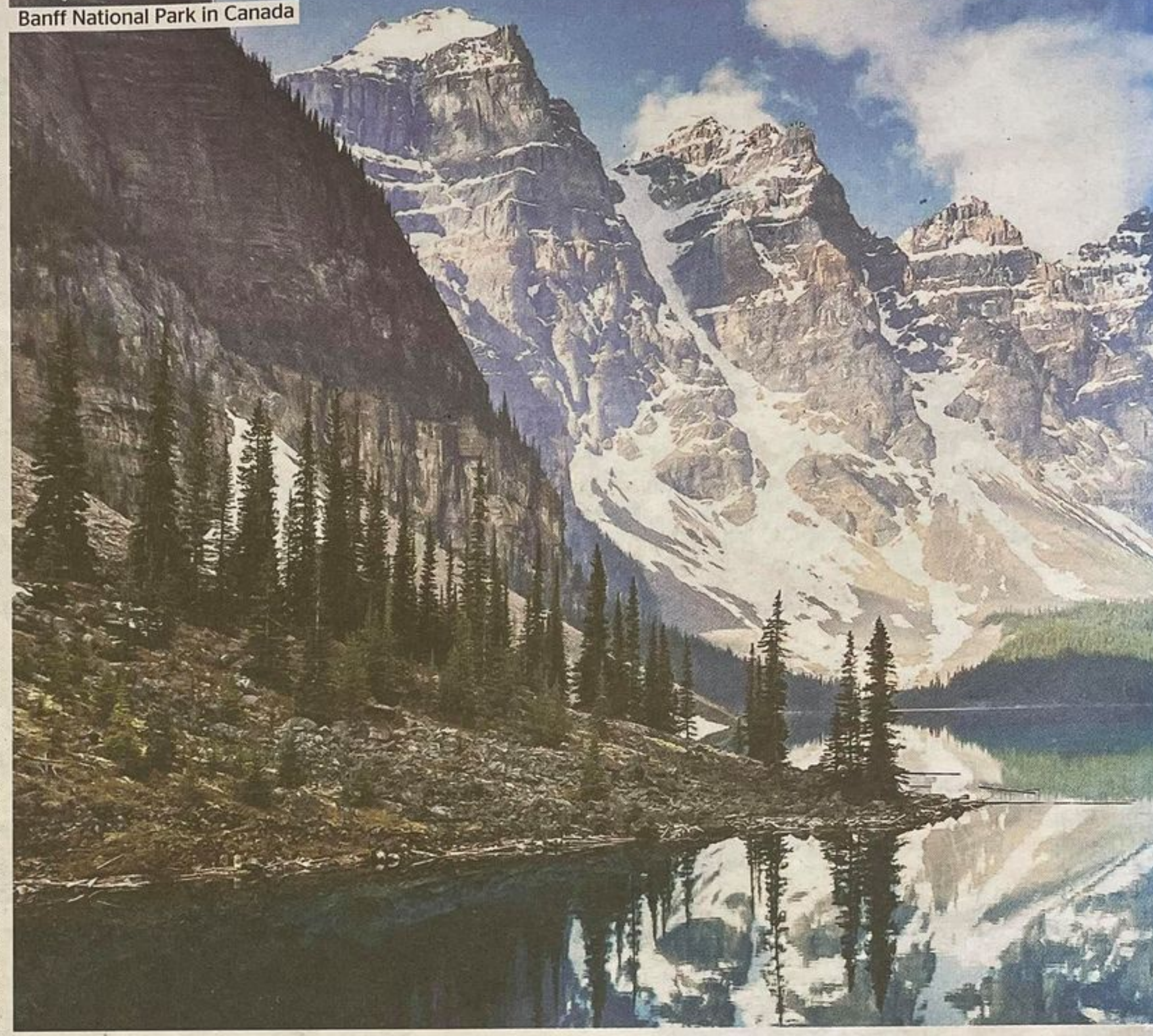
Banff National Park in Canada