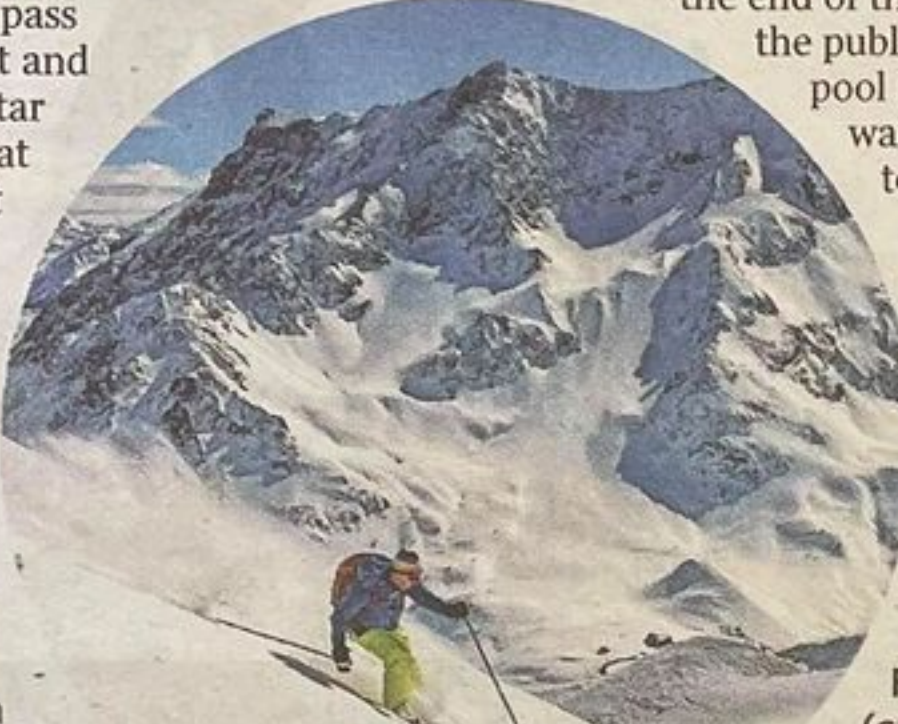
Les Deux Alpes in France

Pretty little Champoluc is the kind of low-key resort families often seek but rarely find, and the Chalet Hotel de Champoluc has the plum spot, next to its main lift station. Here Esprit offers a nanny service for babies and toddlers as well as supervised lunches