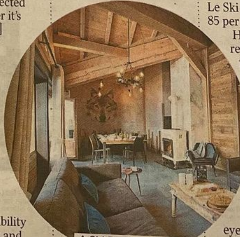
A Ski Beat chalet in Val-d'Isère, France

That's not to say that all is doom and gloom in the ski industry. How could it be when bookings are suddenly flooding in and everyone is buzzing at the thought of the snow. But when programmes are already clogged with holidays deferred from the past two winters, availability is tight, especially over new year and February half-term. The chalet specialist