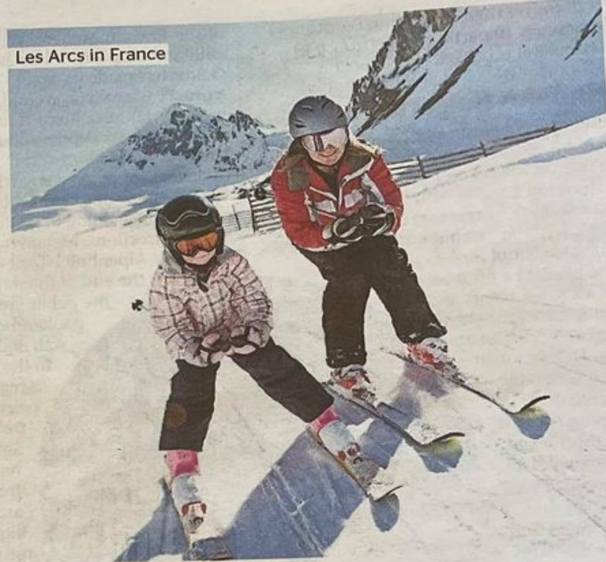
Les Arcs in France